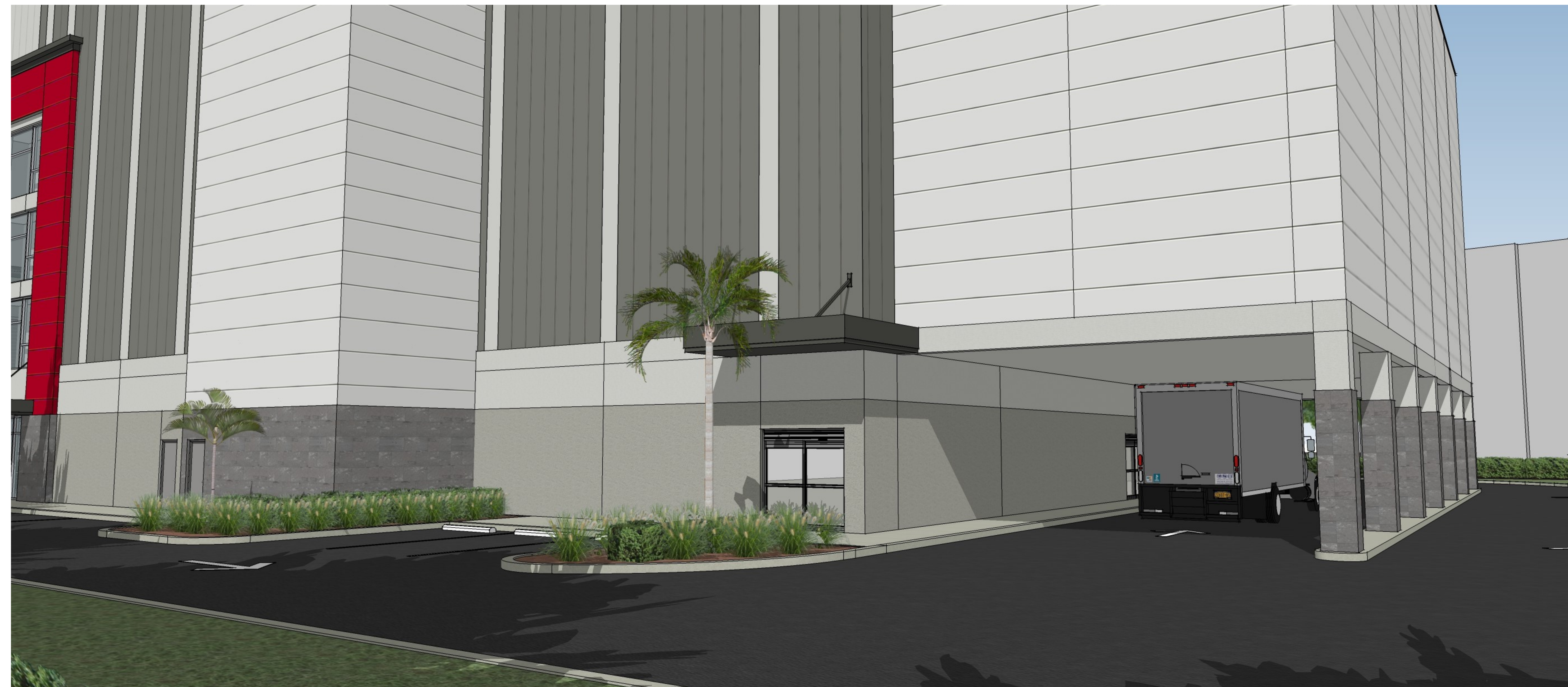
CONCEPTUAL | WEST ELEVATION + LOADING