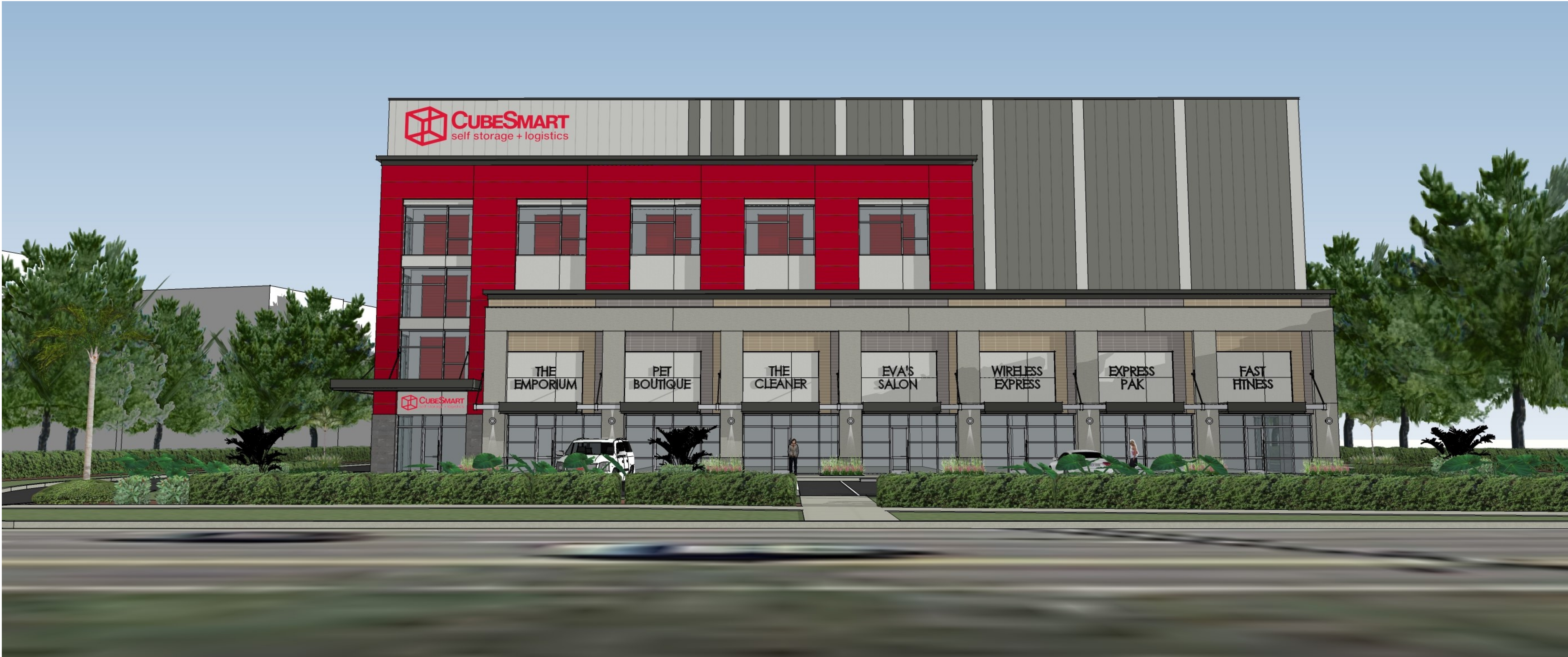
CONCEPTUAL | NORTH ELEVATION