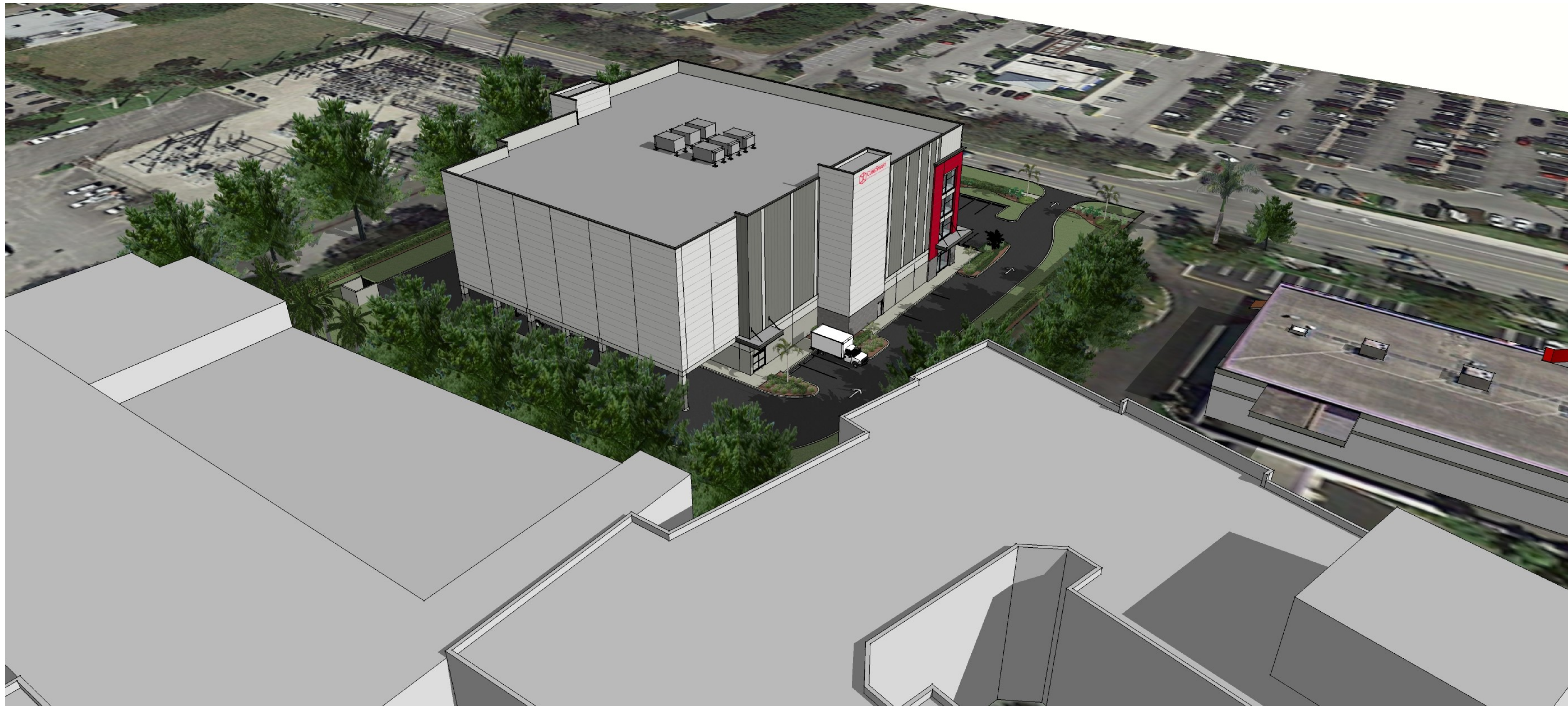
CONCEPTUAL | AERIAL VIEW FROM SOUTHEAST