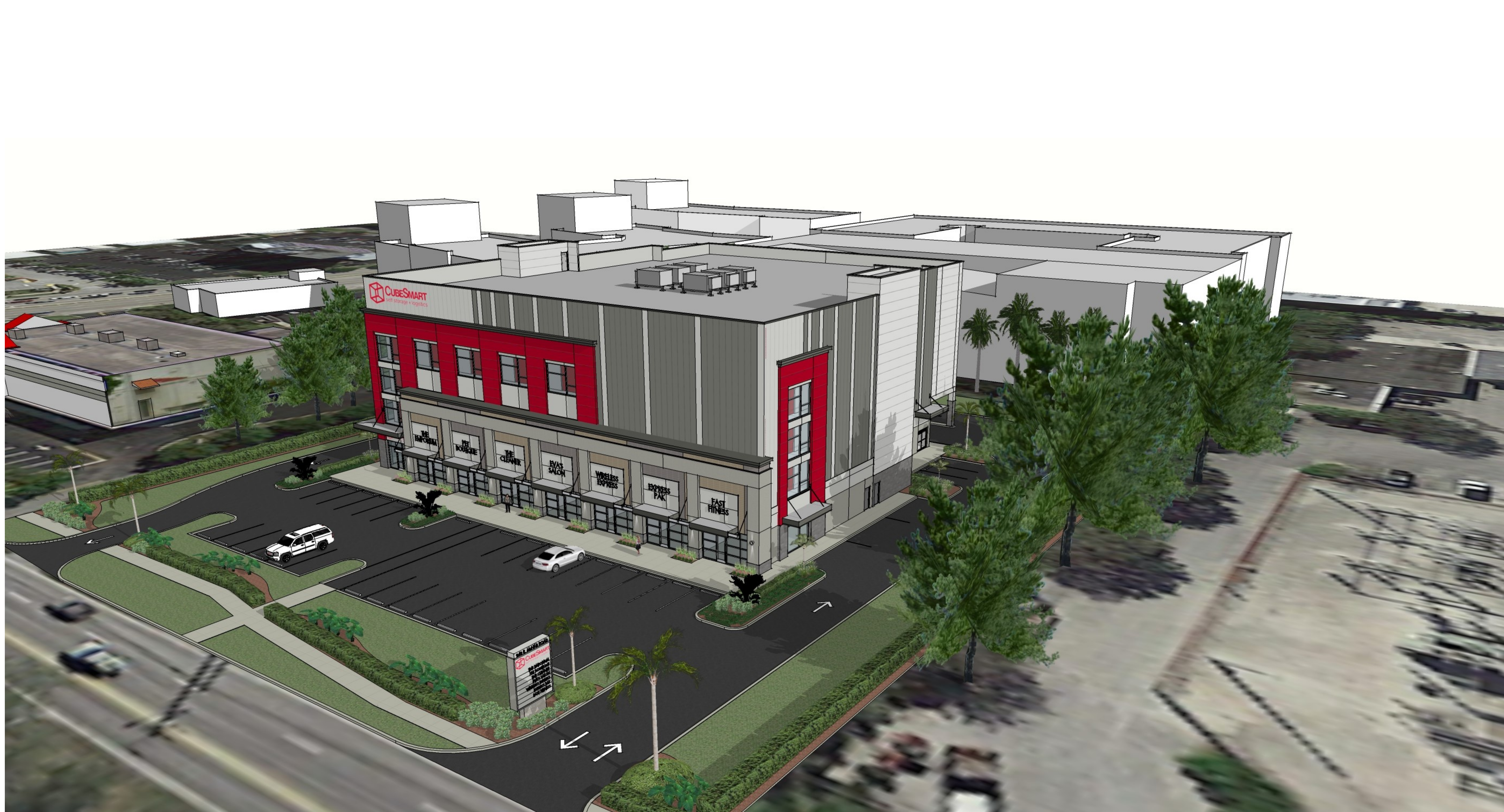
CONCEPTUAL | AERIAL VIEW FROM NORTHWEST