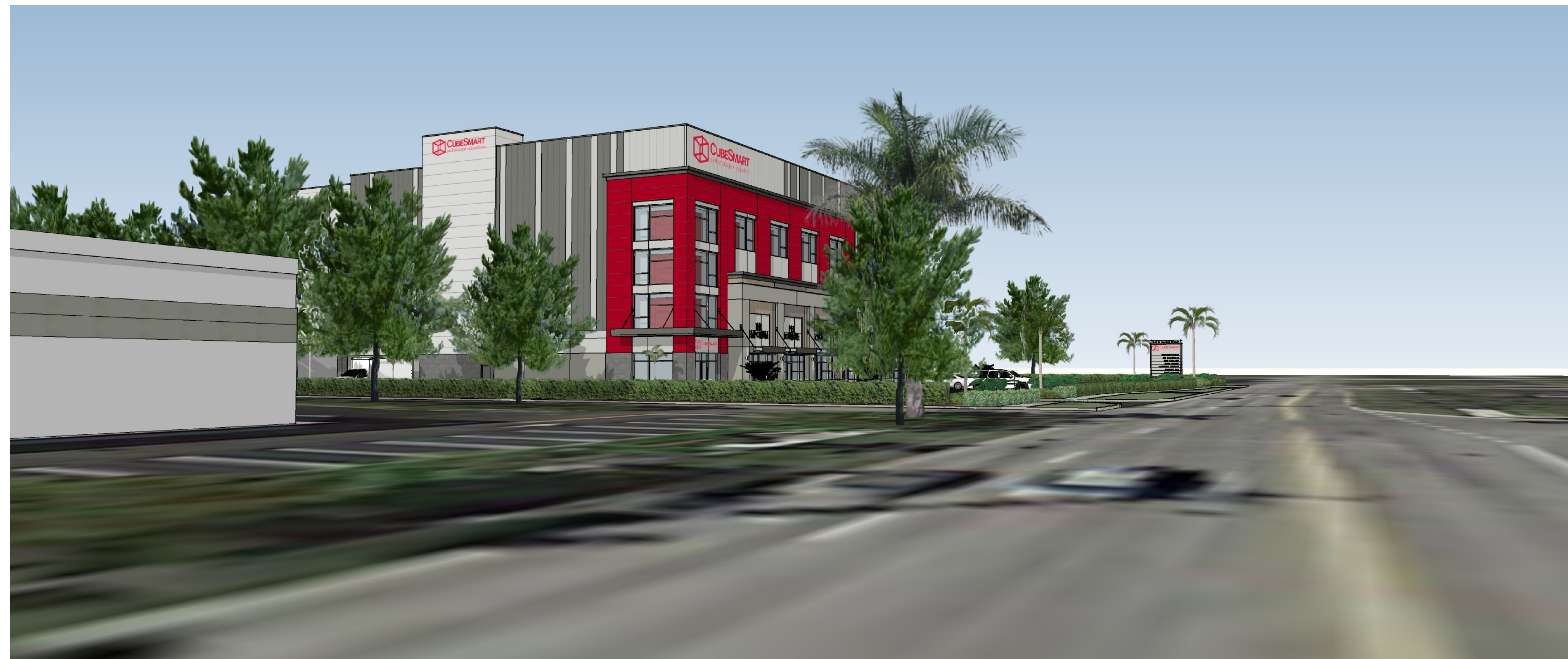
CONCEPTUAL | McNAB ROAD APPROACH FROM EAST