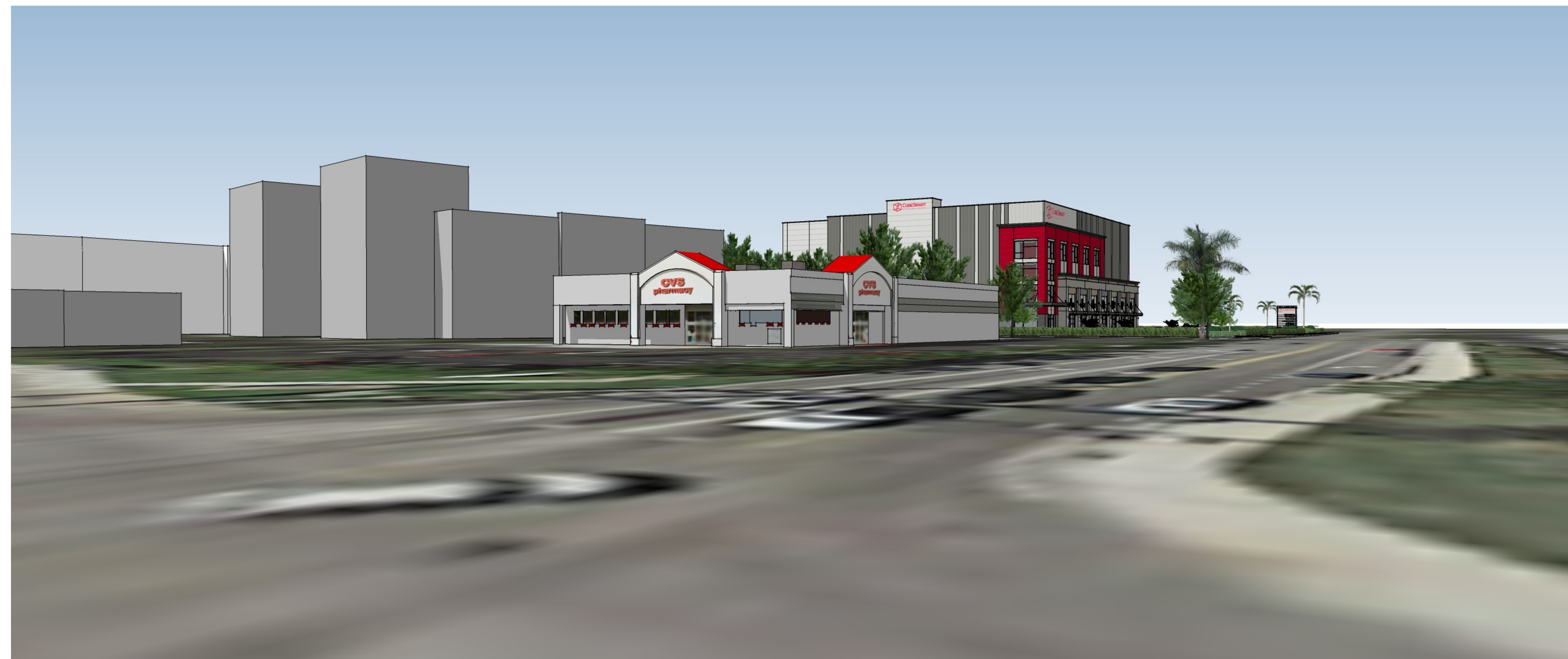
CONCEPTUAL | VIEW FROM McNAB ROAD AND SOUTH FEDERAL HIGHWAY INTERSECTION