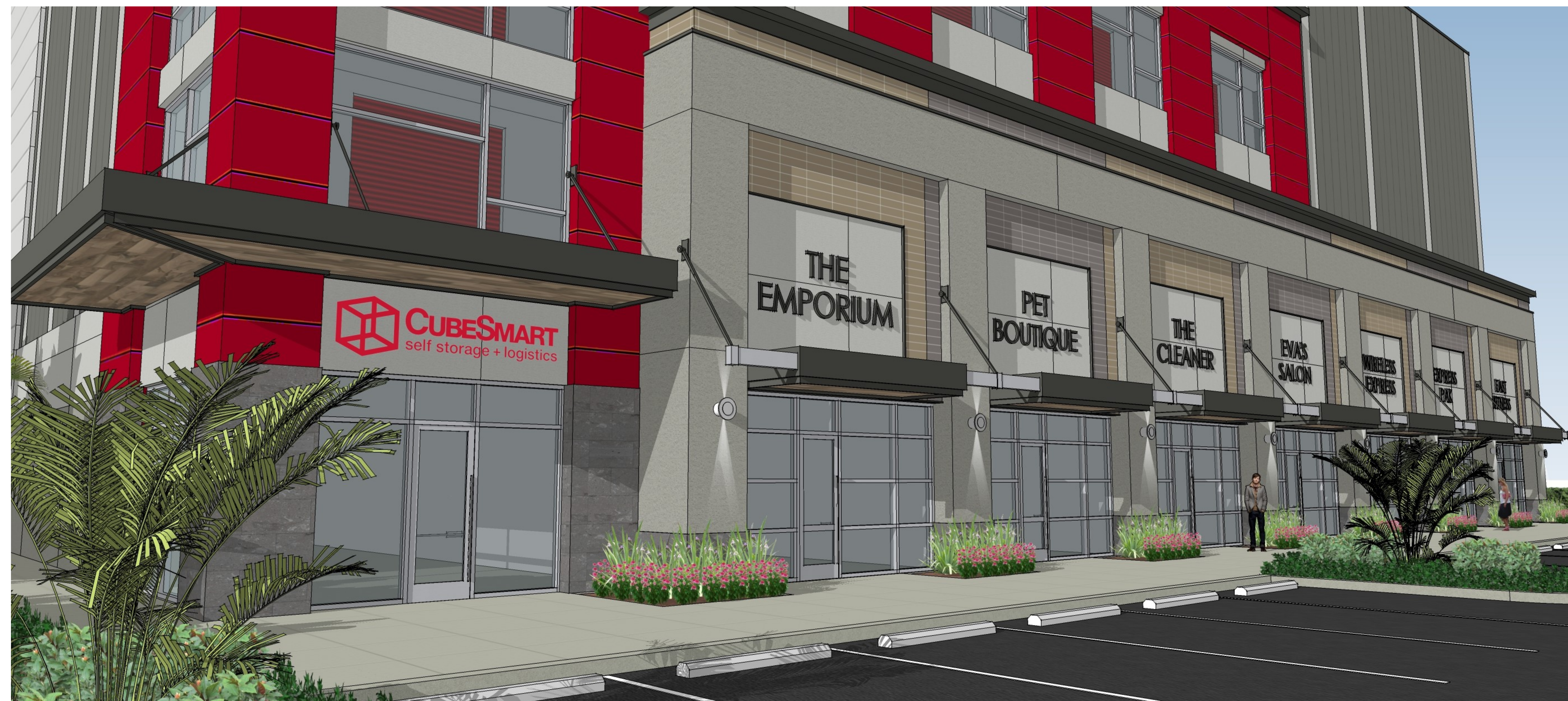
CONCEPTUAL | FAÇADE DETAIL