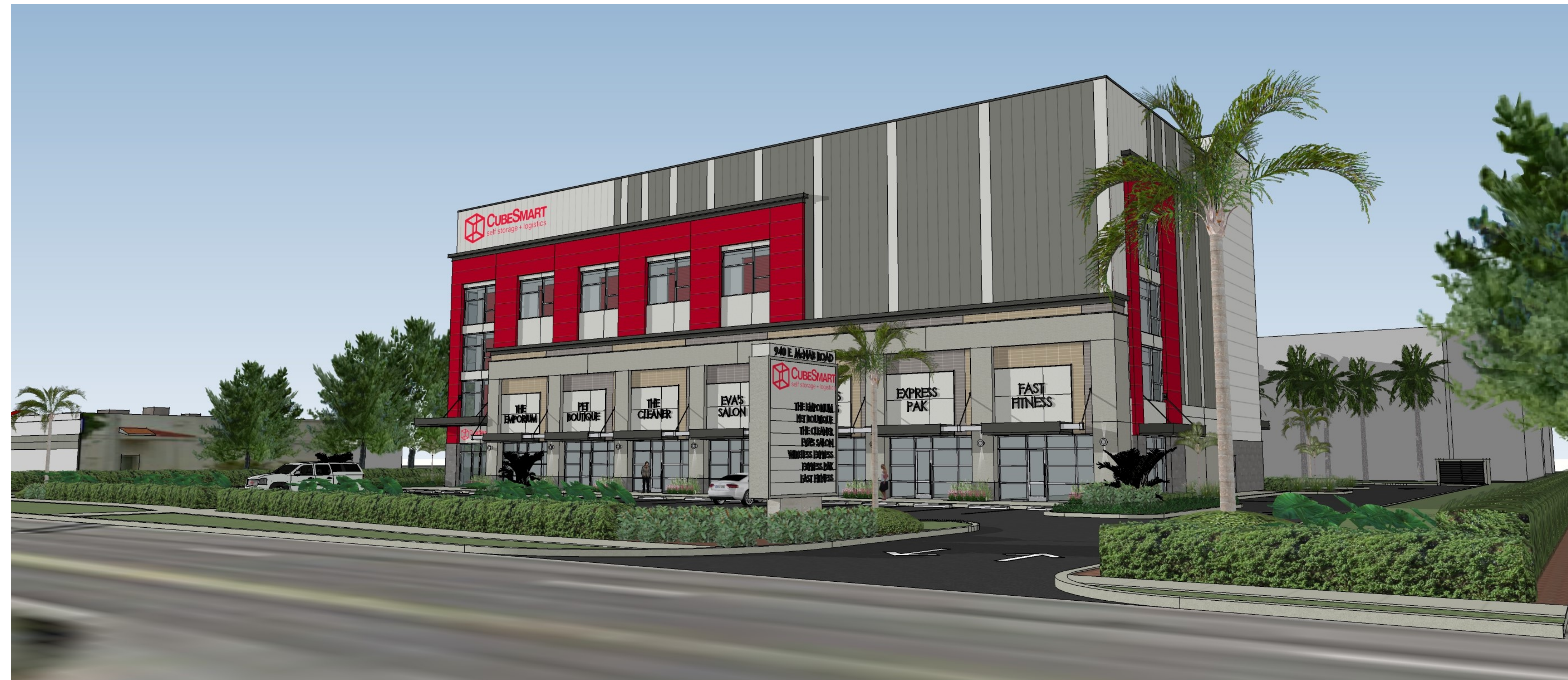
CONCEPTUAL | VIEW FROM ENTRANCE DRIVEWAY